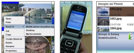
Fig. 1. Downloading a picture from the laptop to the mobile phone with Touch & Connect: select the appropriate option for a picture and touch the tag on the laptop with the phone

For this prototype, an NFC tag is attached to the laptop's armrest and stores the laptop's Bluetooth MAC address which is then used to avoid the time required for searching available Bluetooth devices. Subsequent connections to the NFC tag are then used to initiate actual data transfers between the devices. This also eliminates problems concerning searching for previously paired devices as the device names can be ambiguous. Using the NFC tag when transferring data, the user can directly specify the target device which can be automatically inferred by the application.