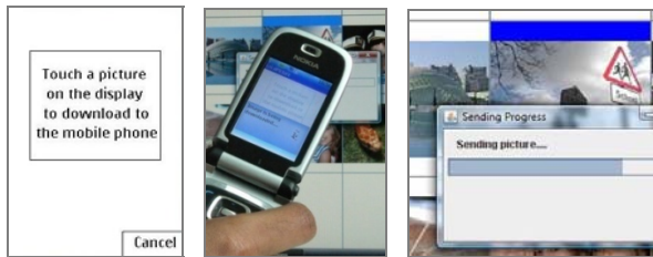
Fig. 3. Downloading a picture from the laptop to the mobile phone with Touch & Select

The picture browsing application has been implemented in such a way that each photo item corresponds in its position to a tag in the back of the display. Even though this mapping suggests itself for this application, we argue that this is also possible for other types of applications based on sharing of information. With smaller tags coming on the market, the grid granularity can be increased such that a more precise location of the phone can be tracked. To upload a picture with Touch & Select, the user first selects it on the phone and chooses upload. The mobile phone then informs the user